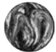
HAMMER ABSOLUTE CURVE