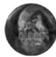
HAMMER COLD BLOOD