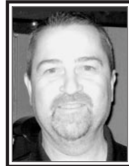
By KEN WYATT

depending on the number of entries) will bowl single-elimination, head-to-head matches against an opponent until a winner is crowned. Each head-to-head match will be a best two-out-of-three games with the exception of the title match, which will be a best three-out-of-five games.