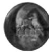
HAMMER COLD BLOOD