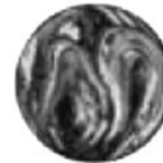
HAMMER ABSOLUTE CURVE