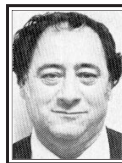
By CHUCK PEZZANO

◆ Top pro golfers, and even some that aren't top rated, can win a million dollars and more in a single tournament. Top pro