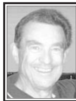
By TOM STROBL

The first third was a particularly hard shot, however, the All Stars were able to post seven 300s and three 800 series. The high scratch series for a woman was Lisa Fogel at 726, while the high scratch game was Darlene Gunter at 269.